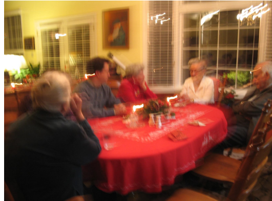
We all really enjoyed the chance to share a great meal and get to know each other a little better.

shoulder. Cards were signed for both members.