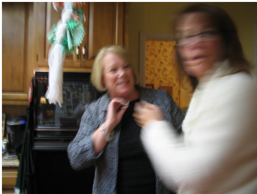
Caught in the act! Checking out great bling for Christmas giving!

The dessert table fairly groaned, featuring a large, luscious trifle, several delectable cakes, and an almond torte. Wow! We cook at least as well as we raise orchids!