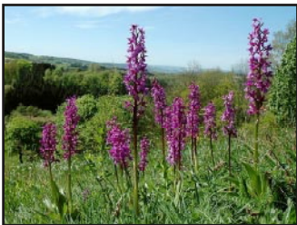
A field of Orchis mascula , a terrestrial orchid