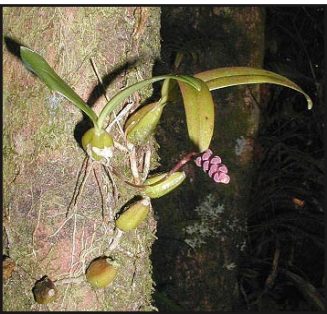
A Bulbophyllum species growing on the side of a tree.