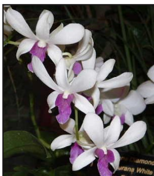
Dendrobium Woo Leng, a beautiful orchid shown at the Gainesville Orchid Society Show in October 2005.