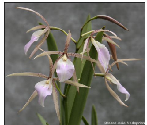
Prosavola Nodoprismo ( Brassavola nodosa x Prosthechea prismocarpa ). This is one of the new intergeneric hybrids discussed on the next page.

25-26 Daytona Beach Orchid Society Show at the Casements, 25 Riverside Dr., Ormond Beach, FL.