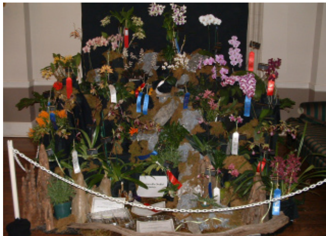
Gainesville Orchid Society