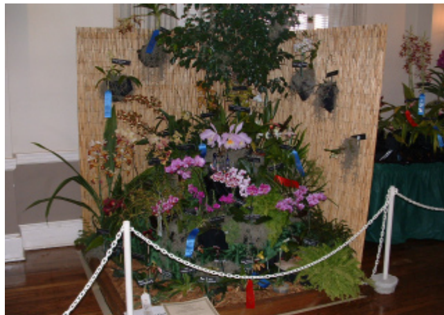
St. Augustine Orchid Society