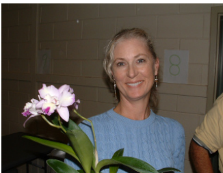
Members of TOS posing with some of their favorite orchids

Next meeting: Thursday, December 7th, 2006. The meeting will commence at 6p.m. See below for more information on the location and directions.