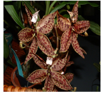
Cycnoches Jean E. Mornier