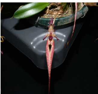
Cirr. Doris Dukes #2